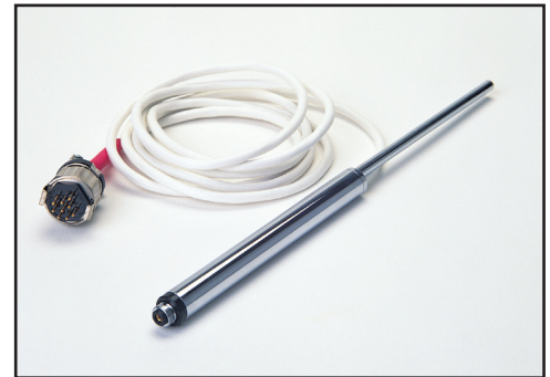
x10 Headstage Probe

The Model 1600 Neuroprobe Intracellular Amplifier has been an industry leader for over 25 years, and is still among the quietest recording amplifiers available on the market.